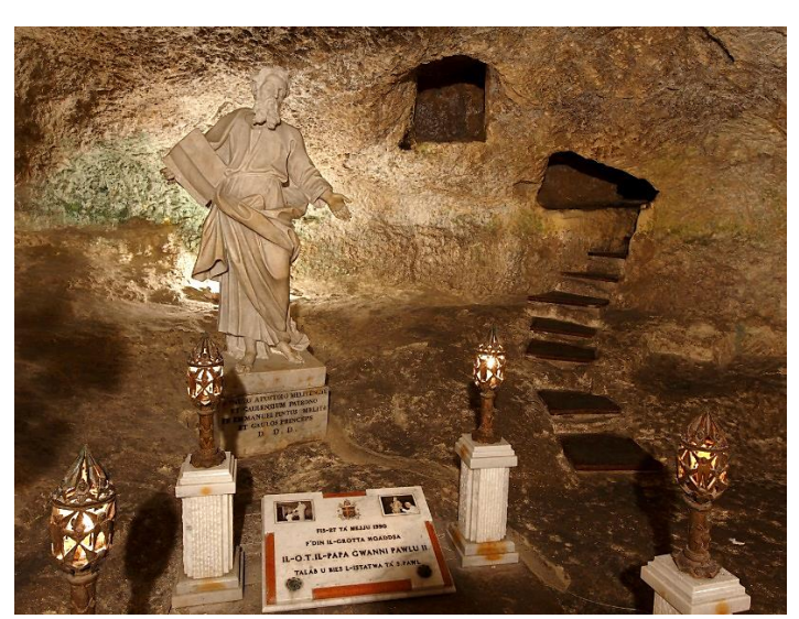
A statue of St. Paul in the grotto dedicated to him in Malta.