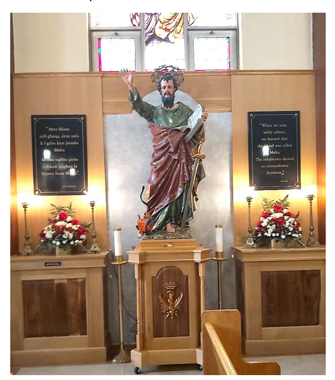
Statue of St. Paul the Apostle, St. Paul the Apostle Church, Toronto

Maltese-Canadiansare blessed that the Maltese-Canadian Church in the heart of 'Malta Village' in Toronto is dedicated to St Paul The Apostle.