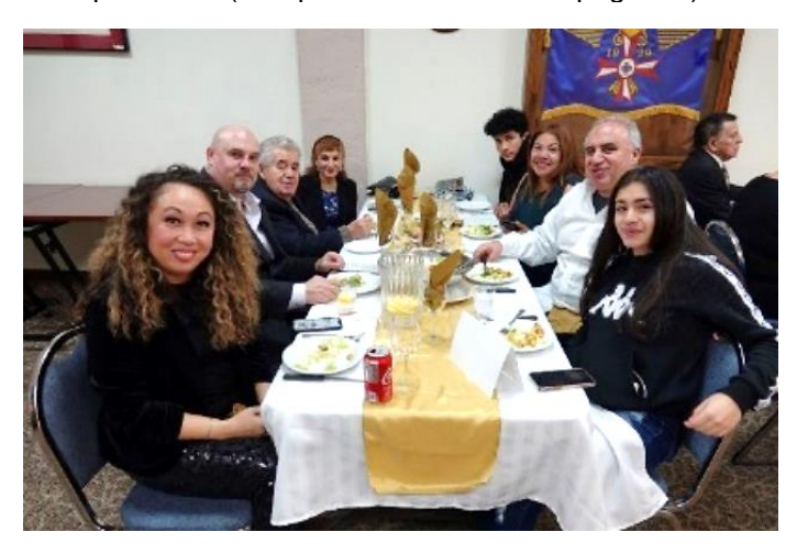
One of the Groups at a Table

A New Year's Eve Dinner and Dance was held at on the club's premises. (See photos below and on page 20.)