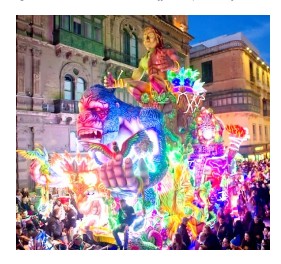
One of the Many Colourful and Creative Floats Seen in Malta during Carnival

Festa oħra popolari, din id-darba ta' kuluri jssir fil-Karnival tal-Gżejjer Malta. Diversi bliet u rħula Maltin u Għawdxin jorganizzaw il-Karnival minn b'laqta' lokali, minn reġjonali u l-Karnival nazzjonali li jsir fil-Belt Valletta. Il-Karnival tan-Nadur, Għawdex huwa mhux biex partikolari, iżda' wkoll għamel ħoss sew fl-isfera internazzjoni fejn ħafna turisti jiġu apposta għal dan il-Karnival msejjaħ 'spontanju.'