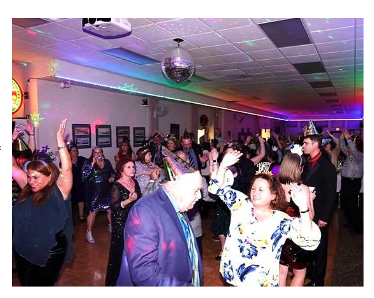
Ringing in the New Year