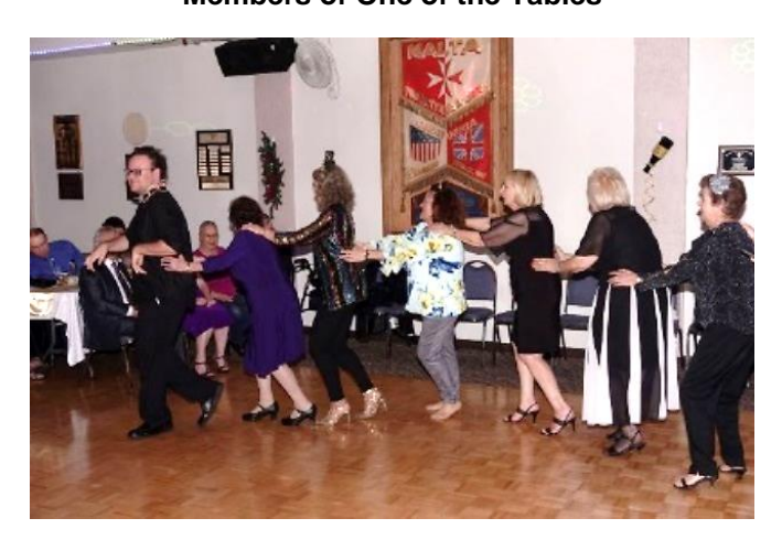
A View of Most of Those in Attendance